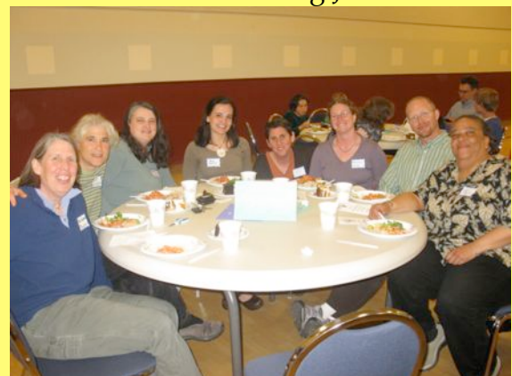
The Schoolhouse Community