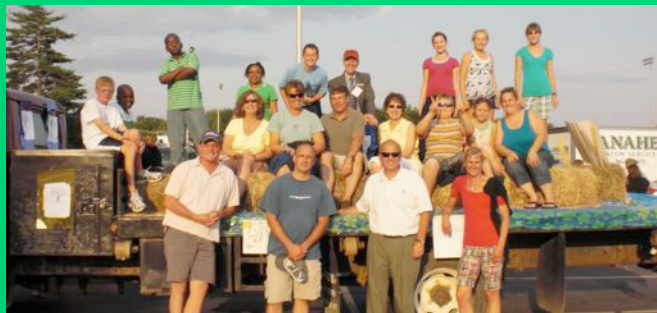
PACT Float, National Night Out 2009